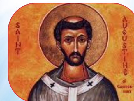
St. Augustine (feast on 28th August)