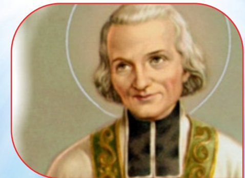
St. John Marie Vianney