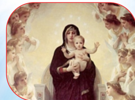
Assumption of Mary (Solemnity on 15th August)